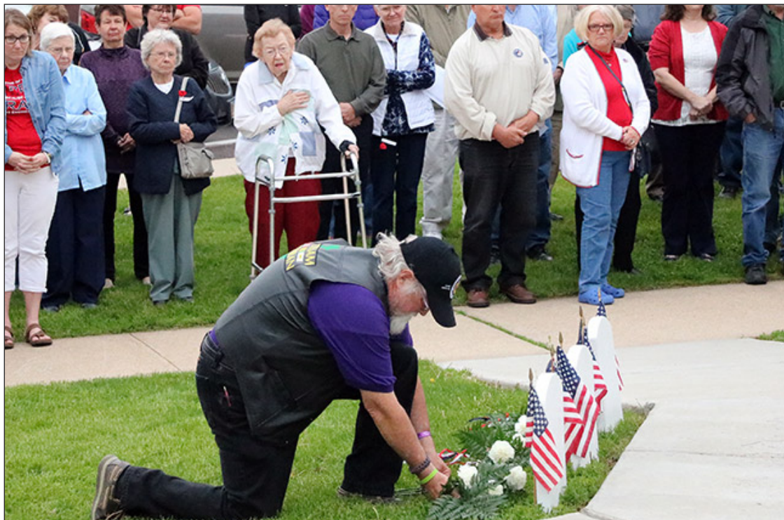
Garretson's own, American Legion Post #23 gathered to honor those who died in service of our free society. This Memorial Day the American Legion is 100 years old. Let us hope we can make a society worthy of their sacrifice.